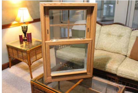
A window company representative should bring a full, working window sample to your home before you purchase.

Remember, new windows should be a one-time investment for your home.