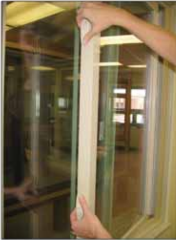
Step Two – Release right sash.

Step Four: Return sashes into their tracks one at a time, left sash first. Use gentle force to push the sash back into the frame until it snaps into place. Repeat for right sash.