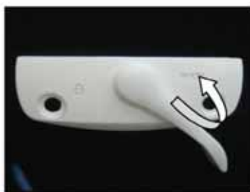
Gently push toward “wash” position.