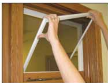
Remove screen at an angle.

Step Three: Holding onto the screen with both hands, maneuver the screen through the top window opening at an angle, so that it can be easily pulled into the house. Sashes may need to be raised or lowered to accommodate the screen.