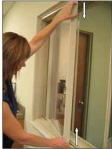
Step Three – Release left sash.

Note: Always make sure the cam locks are in the “unlock” position, and the sashes are open at least 5" on each side.