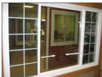
Open both sashes at least 5”.

Step Two: Open both sashes, sliding them at least 5 inches toward the center of the track so there are equal openings at either end of the window. Starting with the right sash, grip the left side of the window and depress the tilt latches. At the same time, use your thumbs to gently rotate the top cam lock from the “unlock” position to the “wash” position.