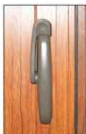
Lever in “unlocked” position.