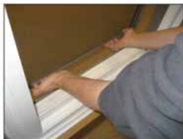
Ease screen into bottom track.