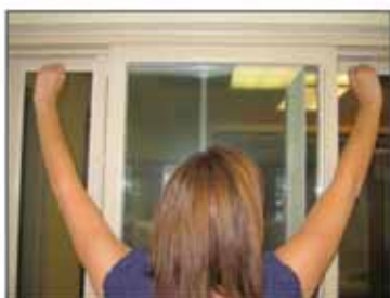
Locate upper and lower tabs.

Step Two: Locate the upper and lower tabs at the corners of the screen. Starting at the bottom of the screen, pull tabs inward (do not push on screen). Using care to hang onto the screen, pull top tabs inward while gently pushing out on the screen. Once all four tabs have been opened, the screen is ready to be removed.