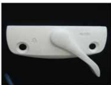
Cam lock in “unlocked” position.

Step One: Standing in front of the window, locate the cam locks on the inside of the sash. Rotate both cam locks from the “lock” to the “unlock” position.