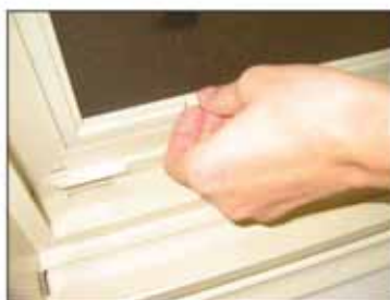
Pull tabs inward.