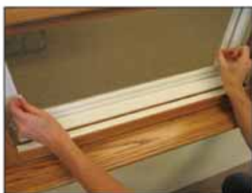
Pull screen tabs inward.

Step Two: Starting at the bottom of the screen, pull tabs inward. Using care to hang onto the screen, pull top tabs inward while gently pushing out on the screen. Once all four tabs have been opened, the screen is ready to be removed. Lift screen up and out to remove from its track, and bring in through the window.