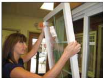
Grip sash and gently pull inward.

Step Two: Open both sashes, sliding them at least 5 inches toward the center of the track so there are equal openings at either end of the window. Starting with the right sash, grip the left side of the window and depress the tilt latches. At the same time, use your thumbs to gently rotate the top cam lock from the “unlock” position to the “wash” position.