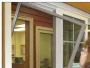
Guide screen into top track.

Reverse all removal steps, carefully guiding the screen back inside its top track by lifting it up into the top track before easing the bottom screen securely into place. If the screen does not easily go back into place, this is likely an indication that the top of the screen is not correctly in position. Carefully adjust the screen so it is positioned correctly in the top track before easing it into the bottom track.