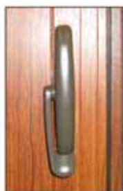
Lever in “locked” position.

Note: Excessive force will damage the crank handle, causing a condition not covered by the warranty.