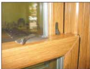
Limit latch reduces sash travel.

Stanek Double-Hung Windows feature limit latches which limit sash travel.