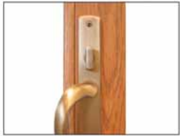
Interior thumb-turn deadbolt.