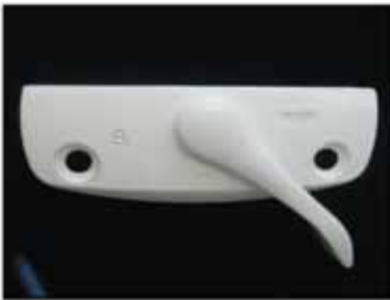
Cam lock in "unlocked" position.

Step One: Standing in front of the window, locate the cam locks. Rotate both cam locks from the "lock" to the "unlock" position.