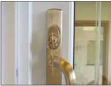
Exterior key lock.