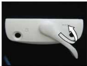
Gently push toward "wash" position.