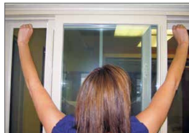
Locate upper and lower tabs.

STEP 2: Locate the upper and lower tabs at the corners of the screen. Starting at the bottom of the screen, pull tabs inward (do not push on screen). Using care to hang onto the screen, pull top tabs inward while gently pushing out on the screen. Once all four tabs have been opened, the screen is ready to be removed.