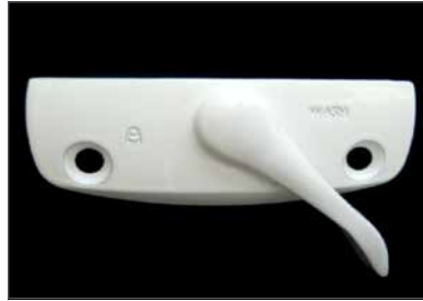
Cam lock in unlocked position.

STEP 1: Standing in front of the window, locate the cam locks on the inside sash. Rotate both cam locks from the “lock” to the “unlock” position.