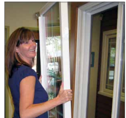
Lift sash up and out of the frame.