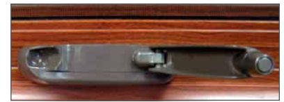
Crank in unfolded position.