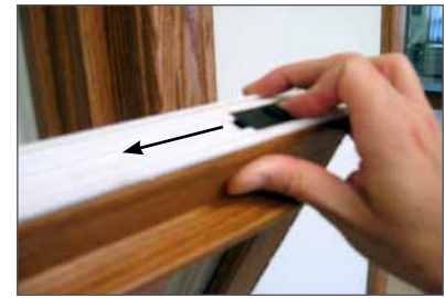
Depress tilt latch and hold.

At the same time, grip the top of the window sash and pull with gentle force toward you to release the top of the sash from its track. Keep the sash balanced and level, lower the top sash until it comes to a rest.