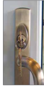
Exterior key lock.