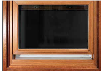
Raise the bottom sash at least 3 inches.

STEP 2: Open the bottom sash, raising it at least 3 inches. Tilt in bottom sash using your thumbs to gently push both cam locks toward the center of the window from the “unlock” position to the “wash” position. At the same time, grip the top of the window sash and pull with gentle force toward you to release the top of the sash from its track.