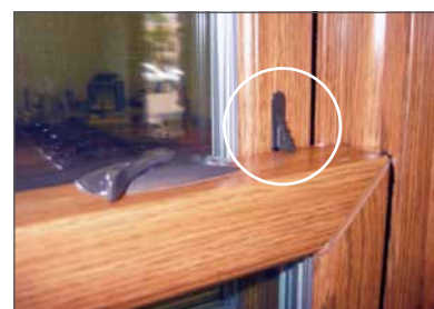
Limit latch reduces sash travel.

CAUTION: Limit latches are not a safeguard against break-ins. Never leave young children unattended when windows are open or unlocked. Never leave your home with your windows open and limit latches engaged; they are not locks and are not intended for security purposes.