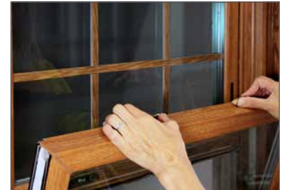
Push both cam locks to the wash position as you pull the sash toward you to release.

STEP 3: Holding the bottom sash securely with both hands, lower the window all the way down until it comes to a rest.