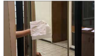
Reach through the opening to clean.

NOTE: Awning windows cannot be cleaned from the inside. They can only be cleaned from the outside.