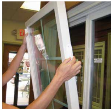
Grip sash and gently pull inward.

NOTE: Always make sure the cam locks are in the “unlock” position.