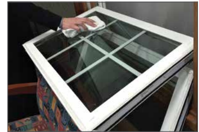
Rest top sash on a chair back.

STEP 5: Return sashes into their tracks one at a time, top sash first. Using both hands, return sash to an upright position, keeping level and balanced. Use gentle force to push the sash back into the frame until it snaps into place. Repeat for bottom sash.