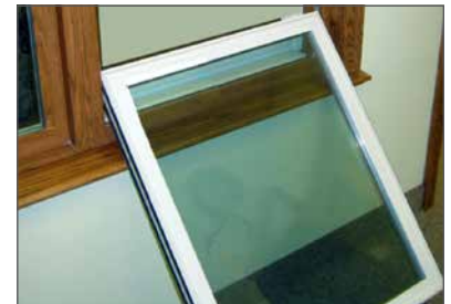
Note: Use care when lowering window sashes, in order to keep balanced and level as you guide to a resting position.

STEP 4: Keep bottom sash open and resting downward inside your home. Open the top sash, lowering it at least 3 inches. Depress the tilt latches on the top sash by sliding them toward the center of the window.