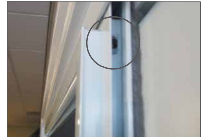
Adjustment screw on screen.

NOTE: Each roller has an adjustment screw located on the side of the screen. Each screw must be loosened in order to lift the screen frame from its track.