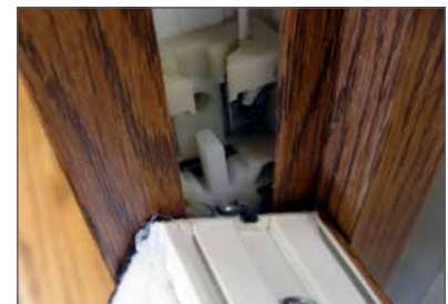
Location of arrow-shaped safety tab.