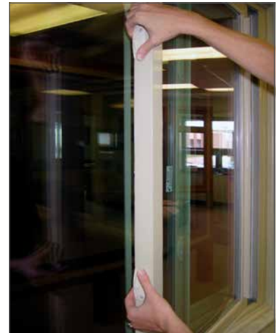
Release right sash.

STEP 3: To swing in the left sash, simply depress the tilt latches and hold, using gentle force to pull sash inward.