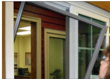
Guide screen into top track.

Reverse all removal steps, carefully guiding the screen back inside its top track by lifting it up into the top track before easing the bottom of the screen securely into place. If the screen does not easily go back into place, this is likely an indication that the top of the screen is not correctly in position. Carefully adjust the screen so it is positioned correctly in the top track before easing it into the bottom track.