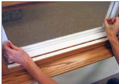
Pull screen tabs inward.

STEP 2: Starting at the bottom of the screen, pull tabs inward. Using care to hang onto the screen, pull top tabs inward while gently pushing out on the screen. Once all four tabs have been opened, the screen is ready to be removed. Lift screen up and out to remove from its track, and bring in through the window.