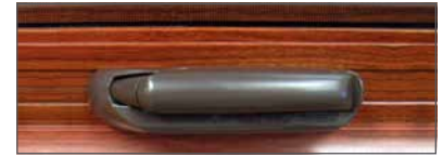
Crank in folded position.