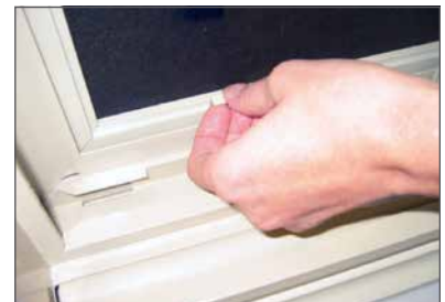
Pull tabs inward.