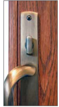
Interior thumb-turn deadbolt.