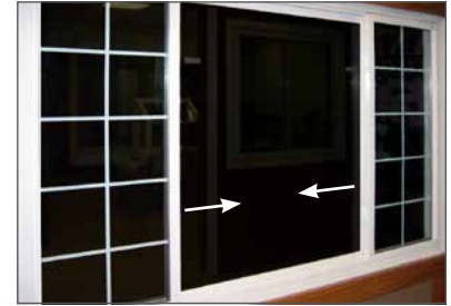
Open both sashes at least five inches.

STEP 2: Open both sashes, sliding them at least five inches toward the center of the track so there are equal openings at either end of the window. Starting with the right sash, grip the left side of the window and depress the tilt latches. At the same time, use your thumbs to gently rotate the top cam lock from the “unlock” position to the “wash” position.