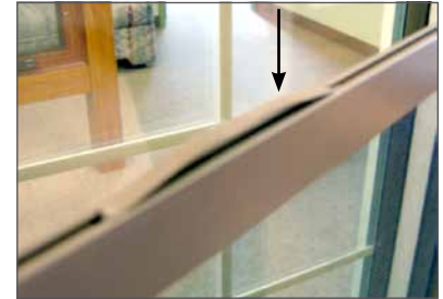
Screens are spring-loaded at the top.

STEP 1: To remove the screen from your conventional sliding window, slide sash open and out of the way. Firmly grip the bottom of the screen rail and lift up while pushing the bottom of the screen outward.