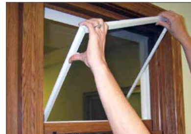
Remove screen at an angle.

STEP 3: Holding onto the screen with both hands, maneuver the screen through the top window opening at an angle, so that it can be easily pulled into the house. Sashes may need to be raised or lowered to accommodate the screen.