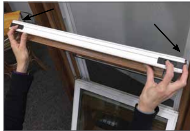
Grip top sash and gently pull inward.

NOTE: We recommend resting top sash on a chair back.