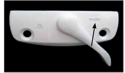
Gently push toward wash position.

STEP 2: Open both sashes, sliding them at least five inches toward the center of the track so that there are equal openings at either end of the window. Starting with the right sash, grip the left side of the window and use your thumbs to gently rotate both cam locks from the “unlock” position to the “wash” position. With gentle force, pull the sash inward (this motion is similar to opening a kitchen cupboard).