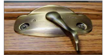
Cam lock in unlocked position.

STEP 1: Standing in front of the window, locate the cam locks. Rotate both cam locks from the “lock” to the “unlock” position.