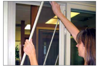
Remove screen at an angle.

STEP 3: Securely holding the screen, lift it up and out to remove it from its track. Grip the screen with one hand to prevent it from falling out. With your other hand, slide the window sashes to one side. Holding the screen with both hands, maneuver the screen through the window opening at an angle, so it can be easily pulled into the house.