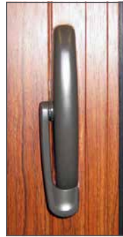
Lever in locked position.

NOTE: Excessive force will damage the crank handle, causing a condition not covered by the warranty.