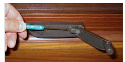
Use a small screwdriver to remove the handle.

Crank handles are fastened with a small set screw that can be removed with a small screwdriver.