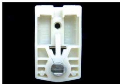
The arrow-shaped safety tab.

Reinstallation of the sash is the responsibility of the homeowner and not covered under warranty. A service charge will be assessed to reinstall sashes that have been removed by the homeowner.