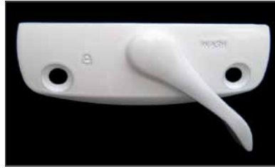
Cam lock in unlocked position.

STEP 1: Standing in front of the window, locate the cam locks on the inside of the sash. Rotate both cam locks from the “lock” to the “unlock” position.