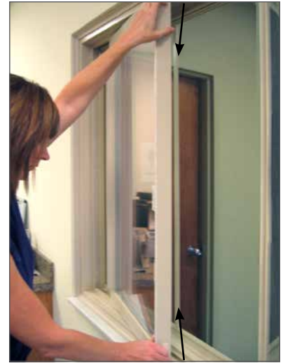
Step 3: Release left sash.

STEP 4: Return sashes into their tracks one at a time, left sash first. Use gentle force to push the sash back into the frame until it snaps into place. Repeat for the right sash.