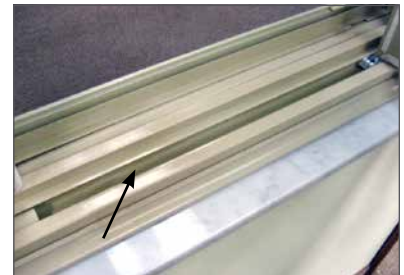
Water in the track after a rainstorm is normal and will drain out.

NOTE: It is the responsibility of the homeowner to keep tracks clean so drainage holes do not become clogged or plugged.