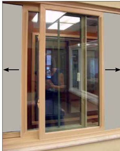
Open both sashes so there are equal openings at either end.

STEP 2: Open both sashes, sliding them at least five inches toward the center of the track so that there are equal openings at either end of the window. Starting with the right sash, grip the left side of the window and use your thumbs to gently rotate both cam locks from the “unlock” position to the “wash” position. With gentle force, pull the sash inward (this motion is similar to opening a kitchen cupboard).