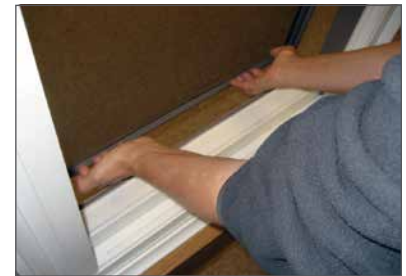
Ease screen into bottom track.