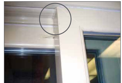
Limit latch reduces sash travel.

CAUTION: Limit latches are not a safeguard against break-ins. Never leave young children unattended when windows are open or unlocked. Never leave your home with your windows open and limit latches engaged; they are not locks and are not intended for security purposes.